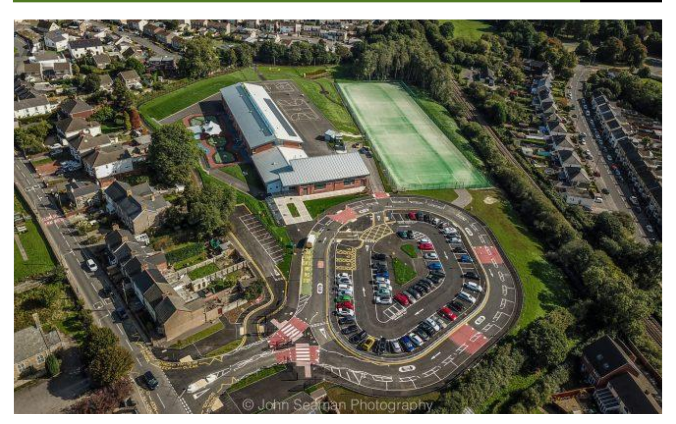
Pencoed Primary 2018